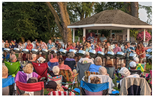
Downtown Thursday Nights Live