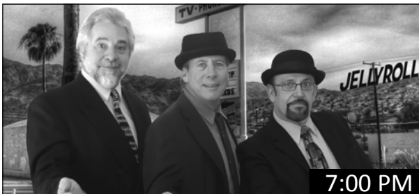
JELLY ROLL BLUES BAND