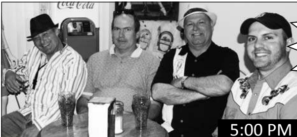
CHEBOYGAN BREW HOUSE BAND