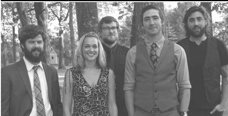
Bad Jam - 5 pm