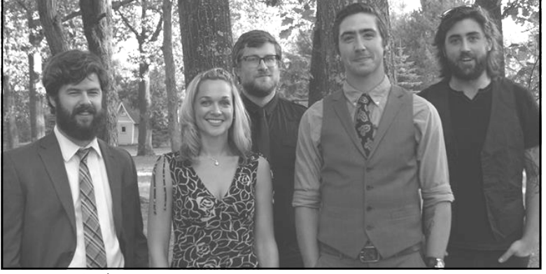
Bad Jam - 5 pm