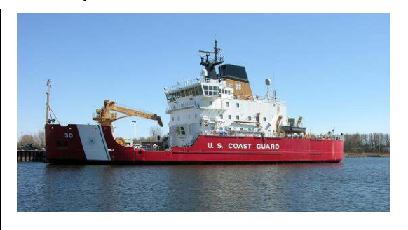
Cheboygan – Home of the Coast Guard Cutter Mackinaw

Pursuant to City Ordinance, all water and/or sewer bills that have a delinquent balance as of September 1, 2016 (delinquent for over 6 months) will be placed as a tax lien on the 2017 City Tax Roll on July 1, 2017. Service could also be subject to shut-off status.