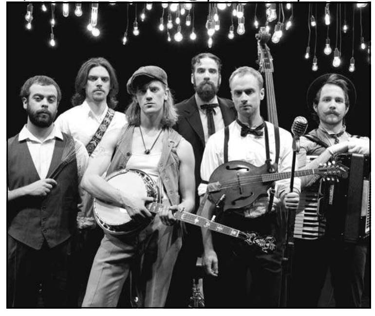
The Hollows - 8 pm