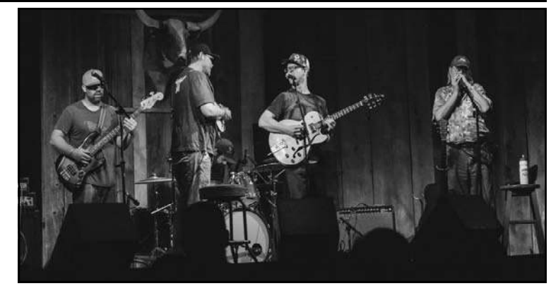
The Honorable Spirits— 5 pm