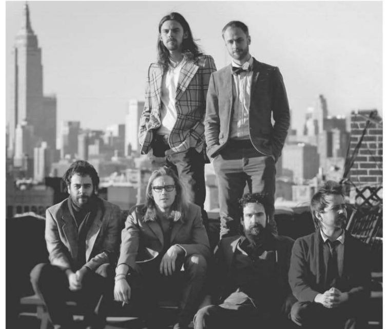
The Hollows - 8 pm

For more information, CALL - (231) 627-9931