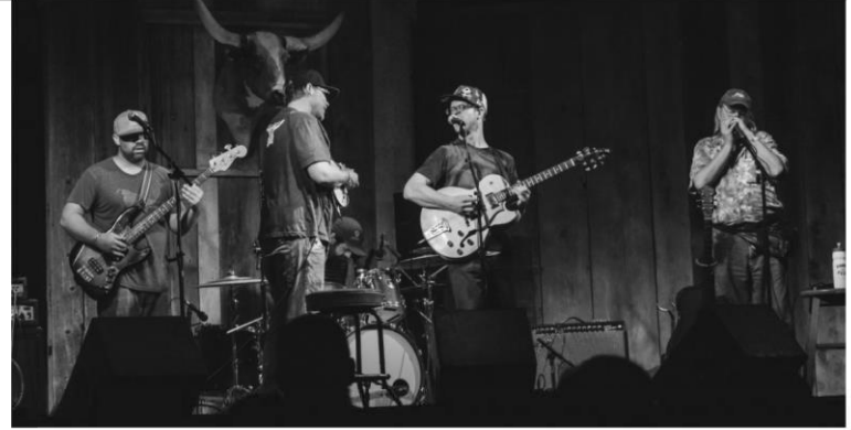
The Honorable Spirits - 4 pm