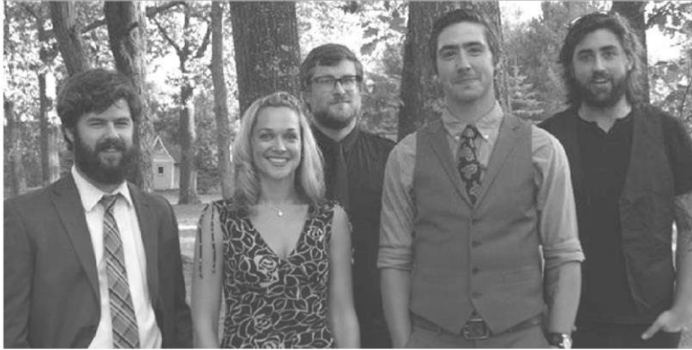
Bad Jam - 5 pm