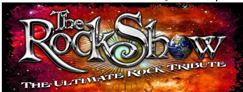
The Rock Show - July 26 @ 8 pm