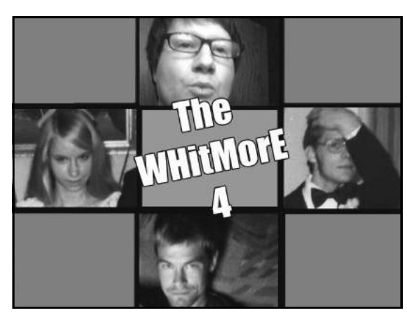
The Whitmore 4 ~ July 26 @ 5 pm