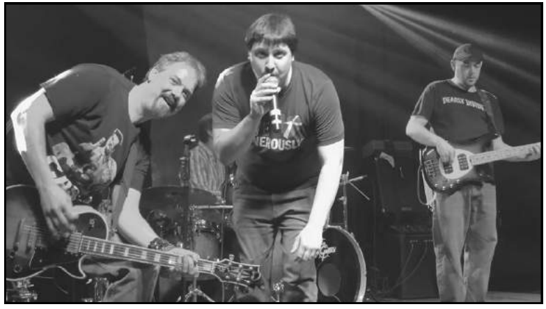
High Speed - July 27 @ 5 pm