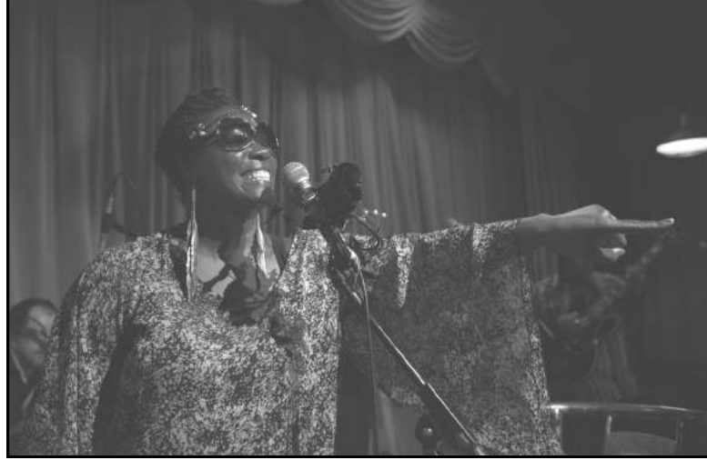
Seríta's Black Rose - July 27 @ 8 pm